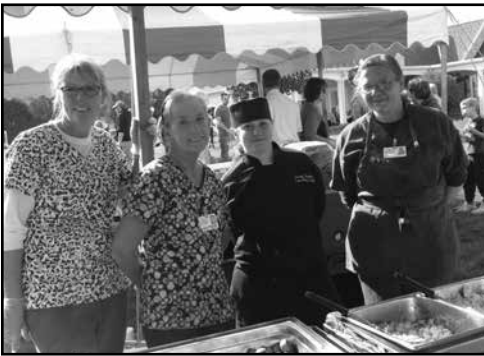
Culinary staff serves a GREAT meal at Oktoberfest.