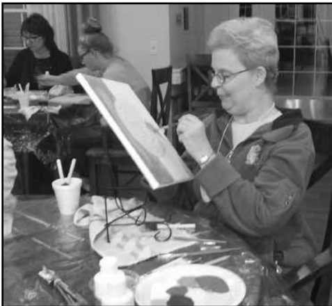
Concentrating on detail.