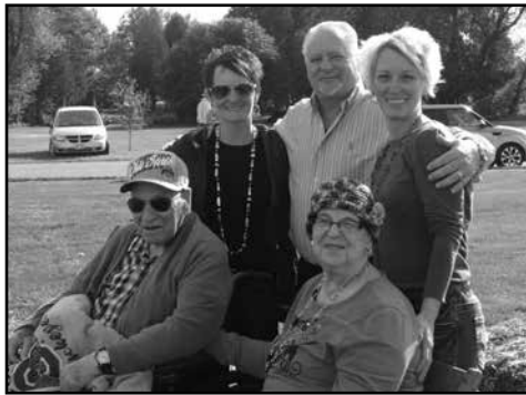
The Feucht family get together at Oktoberfest.