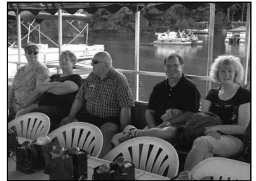
The lake offered a smooth ride for the Marbergers and Bakers.