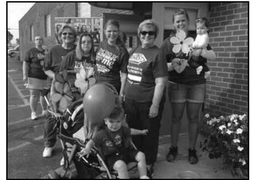
All ages - The Gromley Family is strolling in support.