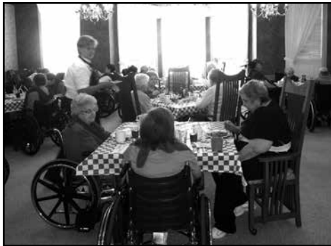
Residents and staff enjoy the "Fish Fry".