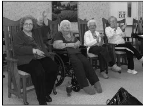
Waiting for the music to start.