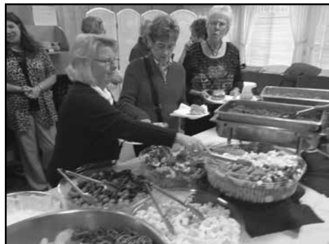
The goodies are always great!