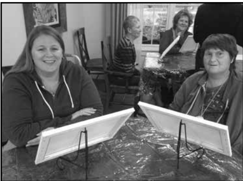
We're ready to begin!