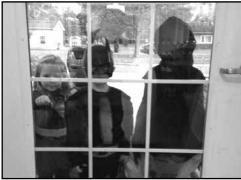
Knock-Knock... Trick or Treat! They were waiting at the front door.