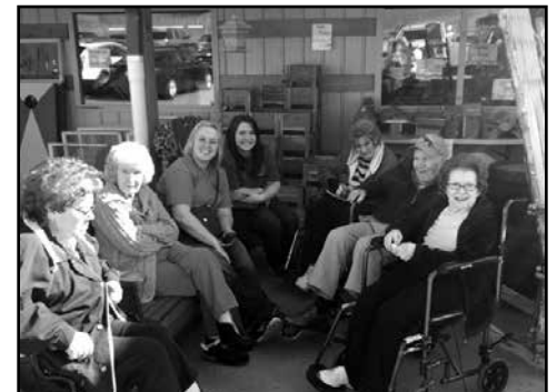
Taking a rest at the Farm