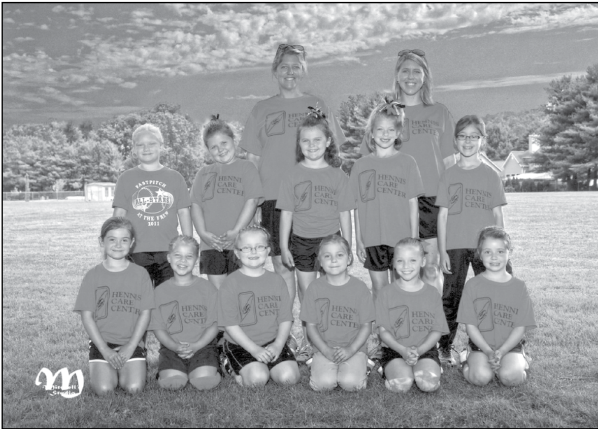
Bolivar Youth Girls Softball Team Sponsored by HCC.

Something Different is Happening Here and you have to See It!