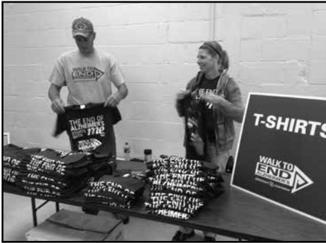
Team t-shirts being distributed.