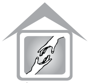
Hennis Care Centre

Wow! What good news it was to receive the announcement that HCC won 1 st place for the best nursing home and retirement community from the Times Reporter Readers' Choice!