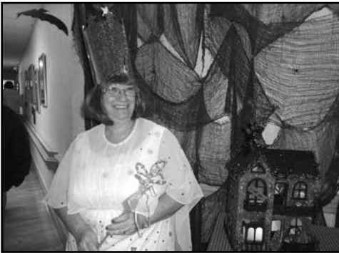
Jeanne, the good witch, is doing a lot of good things!