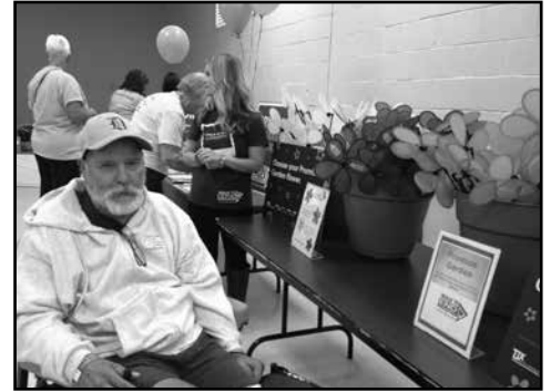
Nice to see a former Bolivar HCC resident attending the walk.