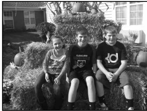
Taking a seat at Oktoberfest.