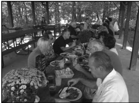
All the guests enjoyed a tranquil, delicious dinner.