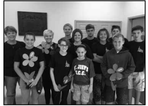
St. John's Youth Group helping at the Alzheimer's Walk.