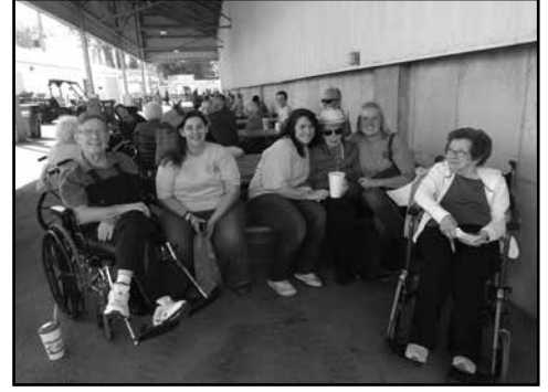
Homestead Gang at the Tuscarawas Fair