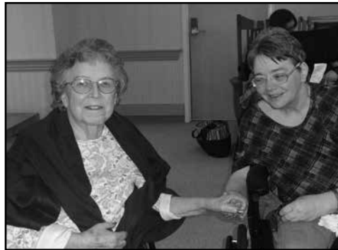
Enjoying the music.