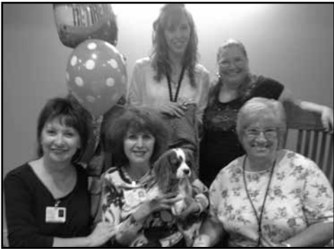
The Dover and Bolivar Activity team lunch, including Bella, the dog, celebrate together.