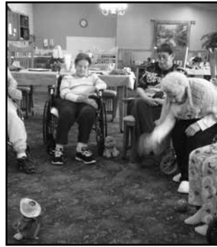
Alice is aiming for a turkey strike with Turkey Bowling!