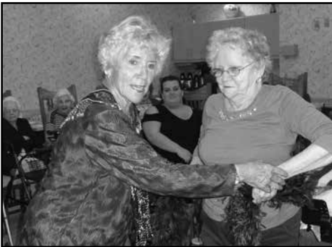
"Let's Do the Twist."