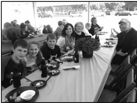
It was a Great Day for all at Oktoberfest!