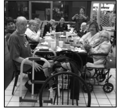
Enjoying lunch at the food court during the mall excursion.