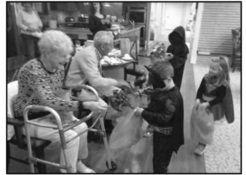
The group share their treats for the costumed visitors.