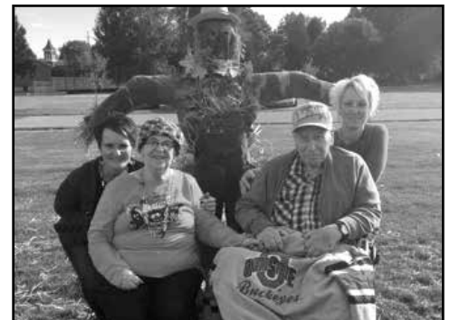
The Feucht family wins our Scarecrow contest.