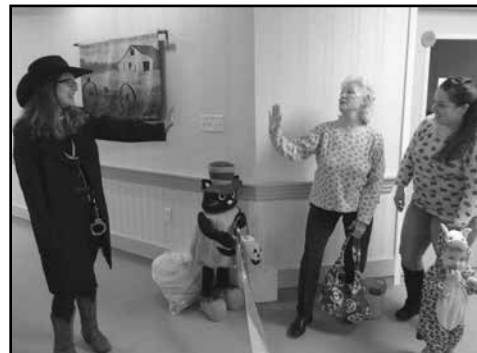
The starting line at our Trick or Treat is guarded by the Sheriff.