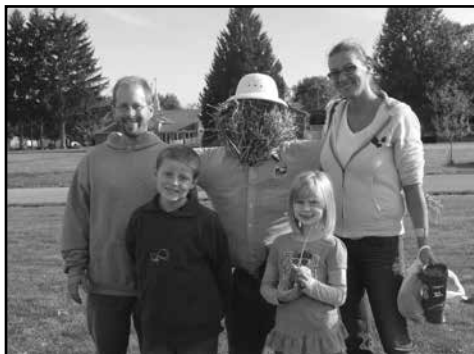
Good family fun at the Oktoberfest.