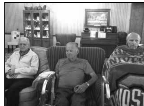
The guys tailgait during OSU game.