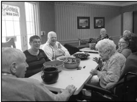
A big discussion is held to decide how the 'Trick or Treat' candy is to be divided.