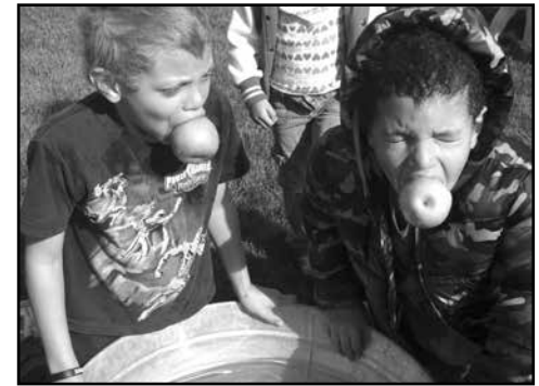
Bobbing for apples at Oktoberfest.