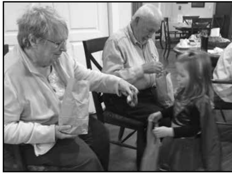
The guests are happy to give this mini Supergirl some candy.