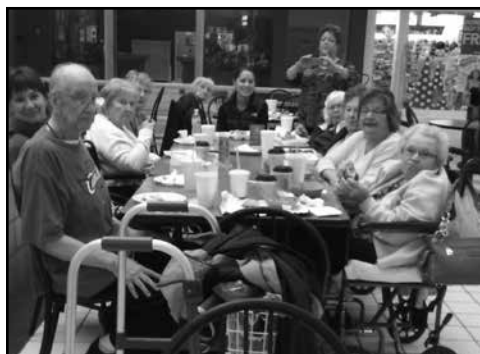
New Town Mall and Lunch Outing