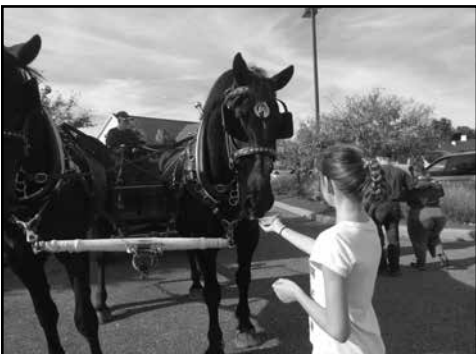
Feeding the horses is fun!