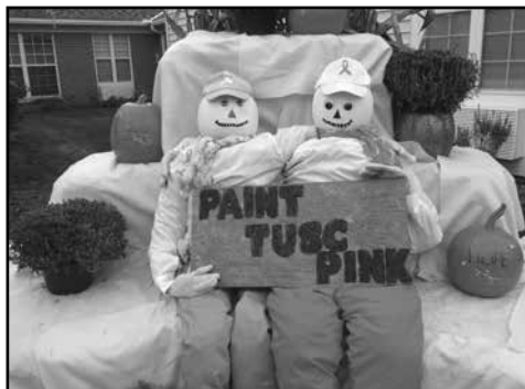
Hennis Paints Tusc Pink